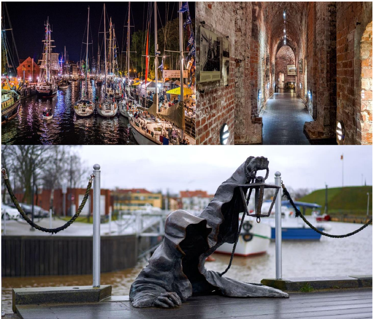
Klaipeda is a beautiful, hospitable city that is open to the world. This is a city on the move.

Klaipeda is also the host for international events like the The Tall Ship Races, the International Castle Jazz Festival and the UIM F2 World Championship.