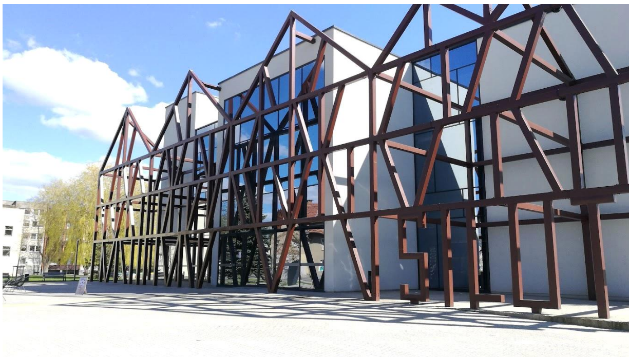
Cultural Center City Šilutė, 12 km from the championship venue. Address: Lietuvininkų g. 6, Šilutė.